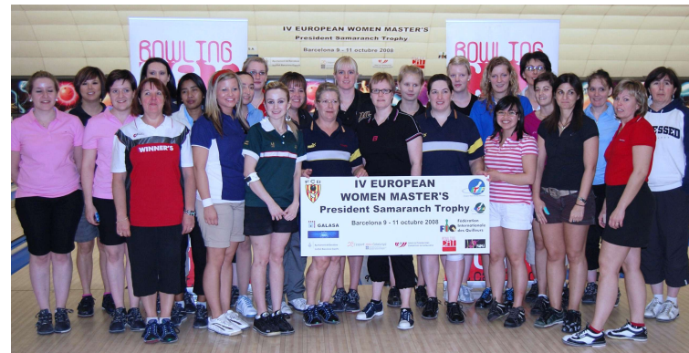
IV European Women Master's 2008