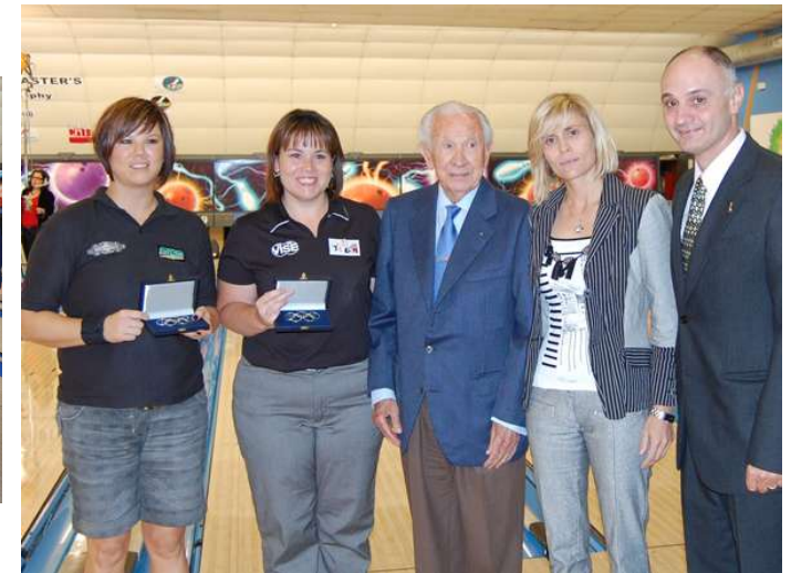
IV European Women Master's 2008