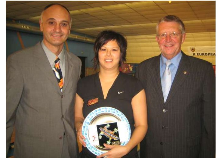
II European Women Master's 2006