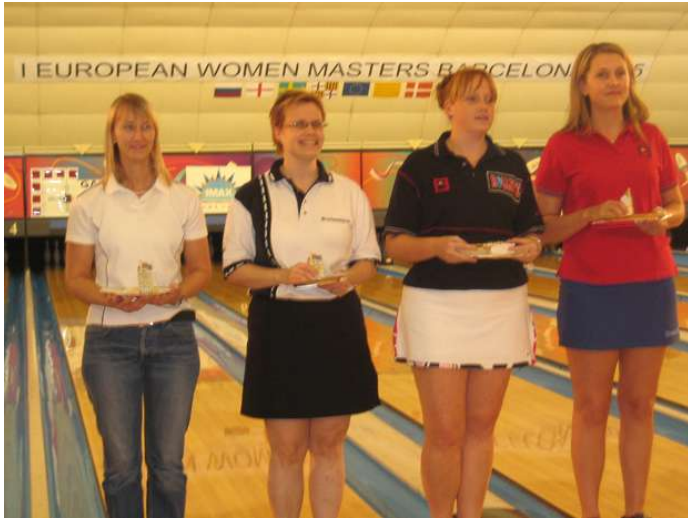
I European Women Master's 2005