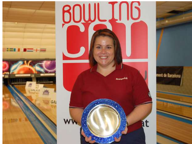
III European Women Master's 2007