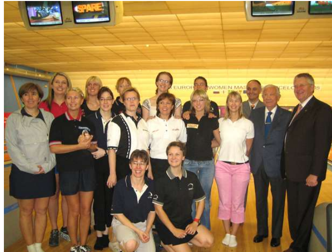
I European Women Master's 2005